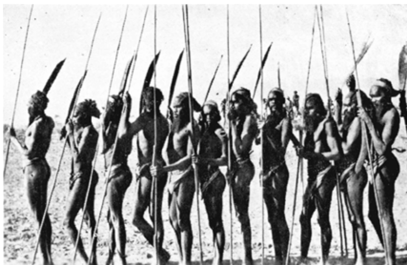
Australian warriors. There as elsewhere, in such gatherings, women are quite rare!

Contrary to popular belief, it is not so easy to explain why this is so. All the “natural” reasons that are generally invoked (reduced mobility due to maternity, the need to protect women because of their importance for the reproduction of the group)