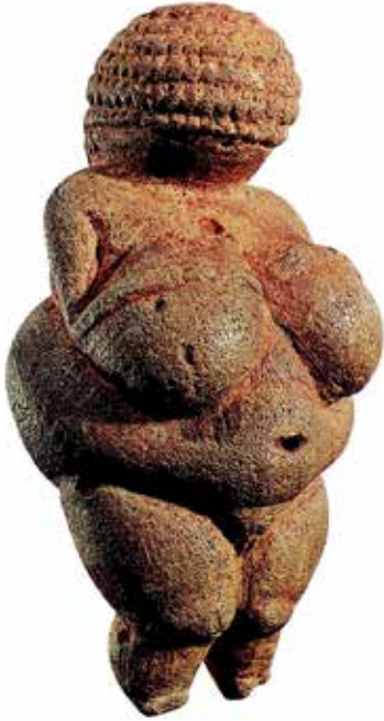
The Willendorf "venus" (around -23 000)

– they were often seen as an indication of a high consideration for women and femininity. Moreover, advances in ethnology had confirmed that the Iroquois were no exception: other primitive societies had been observed in which women held a quite esteemed place.