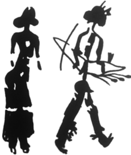
Painting of the Spanish Levant (- 5000 ?) All the archaeological traces confirm the hold of the men on the weapons.

are in fact unsatisfactory. While they may explain why women are temporarily excluded from certain forms of hunting (as would a sick or wounded man), they do not explain why, in all known societies, it is the simple fact of being a woman that forbids, for life, to approach a sharp weapon and to go hunting