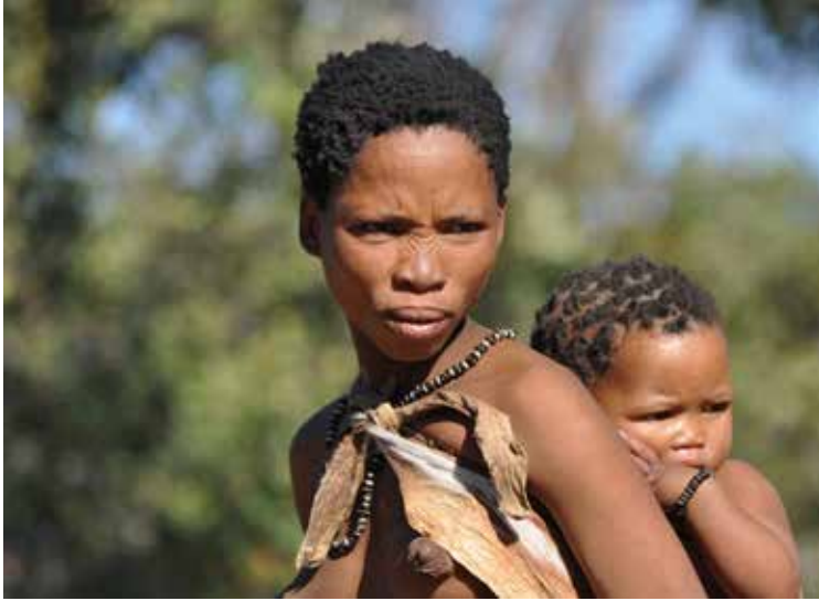
A San woman with her child

or even of mere economic inequalities. This fact alone makes it necessary to revise the scheme inherited from Morgan: on the one hand, in these societies at least, male domination must be explained in ways other than by men's supposed willingness to pass on their possessions to their offspring; on the other hand, these observations suggest (even if they do not in themselves prove it) that male domination dates back to a very distant time.