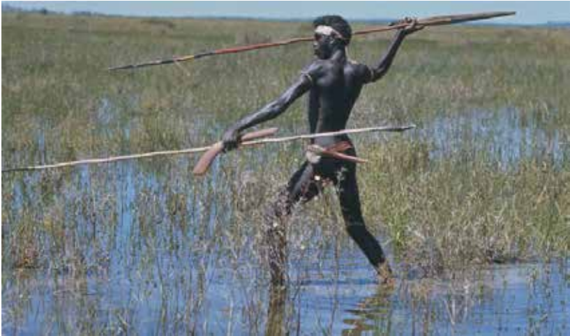
An Aborigine hunting with a spear-thrower

any woman or child who had a view of the sacred objects. But in many tribes, and even more so than the Selk’Nam, women were victims of physical violence by men, whether in the family or when captured by force in neighboring groups. It was also not uncommon for Australian men to lend their wives to each other to seal friendships, or to rape them collectively, either ritually or criminally. Most tribes practiced widespread polygamy, which in some areas could reach record levels - one Aboriginal man was reported to have had 29 spouses during his lifetime.