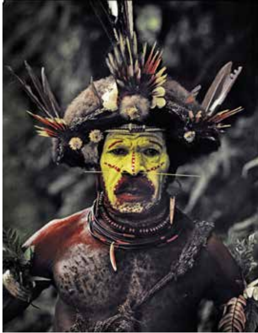
The Huli of New Guinea: champions of corporal décoration... and of sexual segregation

age. Among these peoples, there are no professional priests, soldiers, civil servants or merchants. The first genuinely specialized craftsmen appear only with metallurgy. All men, and all women, perform all the work necessary to satisfy their needs, the only division, usually very strict, being that between the sexes.