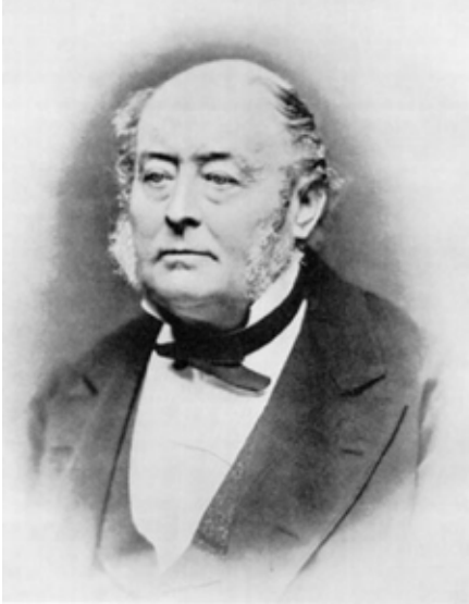
Johann Jakob Bachofen (1815-1887)

were the living image of the distant past of other societies. Like the Iroquois, many barbarian peoples, from which the Greeks originated, recognised only female descent. Playing a crucial role as mothers, women found themselves in a position that was neither inferior nor demeaning. On the contrary, they were highly esteemed, both in society and in the pantheon – Bachofen was convinced of the existence of an ancient and universal religion of the “mother goddess”.