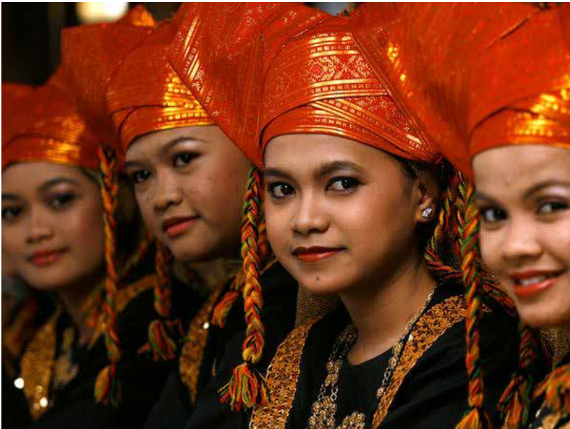
Minangkabau women. Among this people of the island of Sumatra, although Islamized for several centuries, they were the ones who owned the houses, the fields and even the cattle!

It is striking, in fact, that in all primitive societies where women interacted with men on a more or less equal footing, they did so on the basis of their economic influence. Once