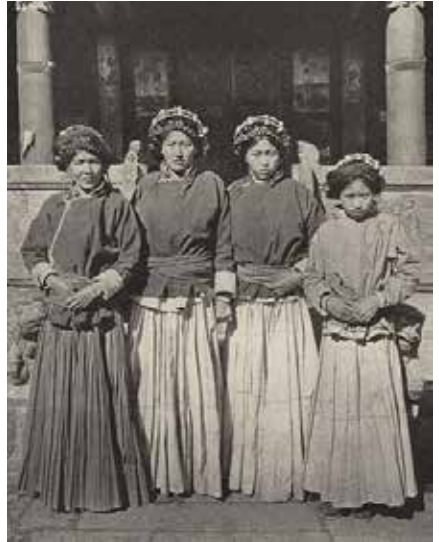
Na (Mosuo) women in 1926

These peoples, where women compete on a more or less equal footing with men, are therefore not, if words have any meaning, matriarchies. But it would be just as misleading to speak of “sex equality” in their regard, for the relations between the sexes are far from the equality we conceive of in our modern world.