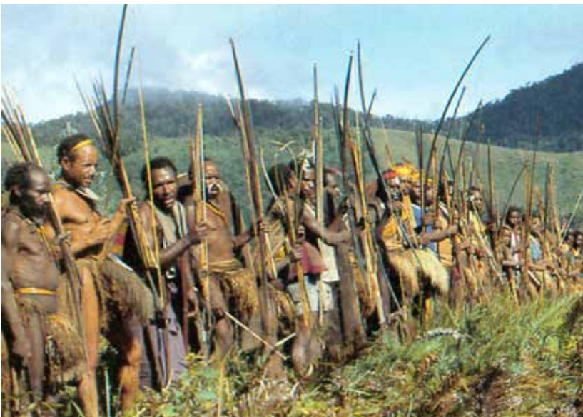
A gathering of Baruya fighters

In Baruya society, the superiority of men was marked on all sides: in kinship denominations as well as in geography, in the valorization of economic activities as well as in religious secrets. Thus a young boy was automatically considered the eldest of all his sisters, even those born before him. In the same spirit, all the paths that meandered through the villages were doubled, one a few meters below the other; naturally, the highest was reserved for men. Whenever women crossed the men's path, they looked away and hid their faces under their cloaks, while they passed by ignoring them. Among other things, women were not allowed to inherit the land, bear arms, or manufacture salt blocks. They were also forbidden to use tools to clear the forest and to make their own digging sticks. As for sacred objects, flutes and bullroarers, they were pro-