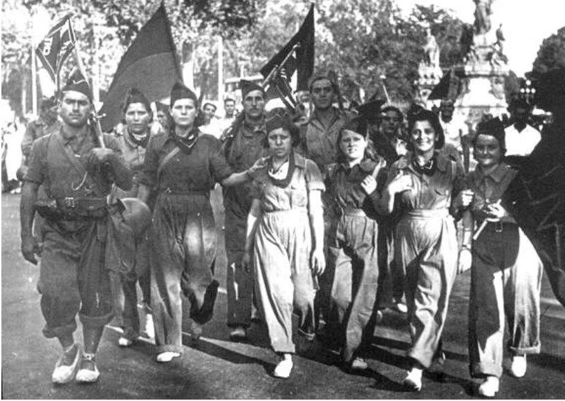
The « mujeres libres », anarchist organization of women during the spanish revolution and civil war. Women's emancipation is closely related to social emancipation.

of this. Even in the few countries of the world where women have achieved some degree of emancipation, it remains under the constant threat of backsliding. In France, abortion remains legal. But for how many women does the dismantling of the public hospital make it more difficult each year to exercise this right? And how can we affirm that the reactionary currents which, until very recently, have been so noisy, will never achieve their ends? One need only look elsewhere in Europe to measure the fragility of a right that seemed to have been taken for granted. As for the poorest part of the planet, crushed by underdevelopment and war, the last forty years have shown time and again that the flag of oppression of women, raised as an “anti-imperialist” symbol, can be successfully used as a diversion from genuine emancipatory struggles – and these currents have gained a certain audience even within the developed countries, among workers of immigrant origin.