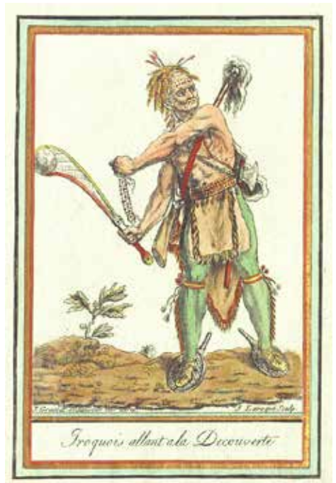
An Iroquois, in a 17th century illustration

Things changed with the publication in 1861 of Mother Right , a book by the Swiss jurist Jakob Bachofen which had a considerable influence. Bachofen took up the idea that the Iroquois