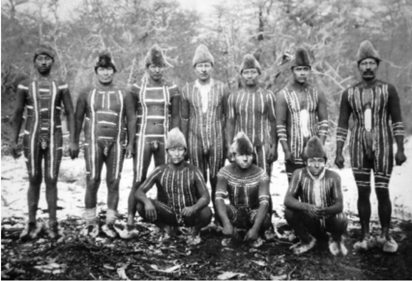
Selk'Nam men in ceremonial paintings

take such stories at face value; such accounts in no way support the authenticity of the early matriarchy. Rather, they clearly serve to justify the existing order, both toward dominant men and dominated women.