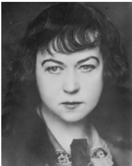
Alexandra Kollontai (1872-1952)

Within this one, an atmosphere of free discussion continued to reign for a few years; hence, some of Morgan's theses and, as a consequence, Engels', began to be called into question. The Bolshevik leader Alexandra Kollontai, for example, did so in the early 1920s in her Conferences on the Liberation of Women . But the debate was soon stifled under the heavy blanket of Stalinism. To criticize Morgan was to criticize Engels; and if one could freely criticize Engels, why not Stalin and his regime? Thus, the privileged who usurped power in Russia proceeded with the writings of the founders of Marxism in the same way as they did with the mortal remains of Lenin: they mummified them to betray their spirit.