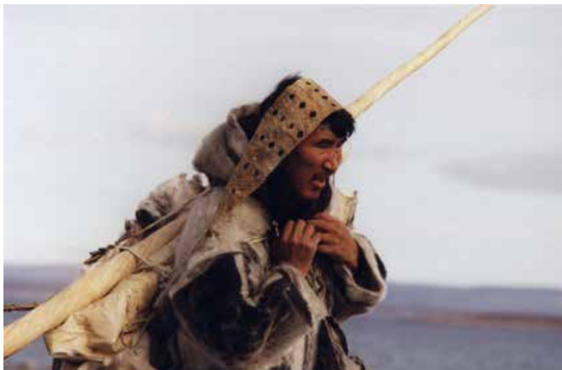
Atanarjuat, inuit hero of the A. Kunuk movie (2001)

fair game as a sexual object for any man who desires her. He grabs her by the belt as a sign of his intentions. If she is reluctant, he may cut off her trousers with a knife and proceed to force her into intercourse. Whether the girl consents or not, these transitory sexual encounters are regarded as matters of no particular importance among the Eskimo.... Physical and verbal aggression among men is frowned on, but sexual aggression against women in the form of abduction or sexual violence is common” 3 .