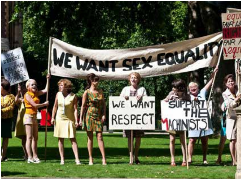
“We want sex equality!”, photo from the eponymous movie (2010), based on the 1969 strike by Ford Dagenham women workers for equal pay.

Thus, by instituting the generalized exchange of the products of labor and of the workers themselves for money, capi-